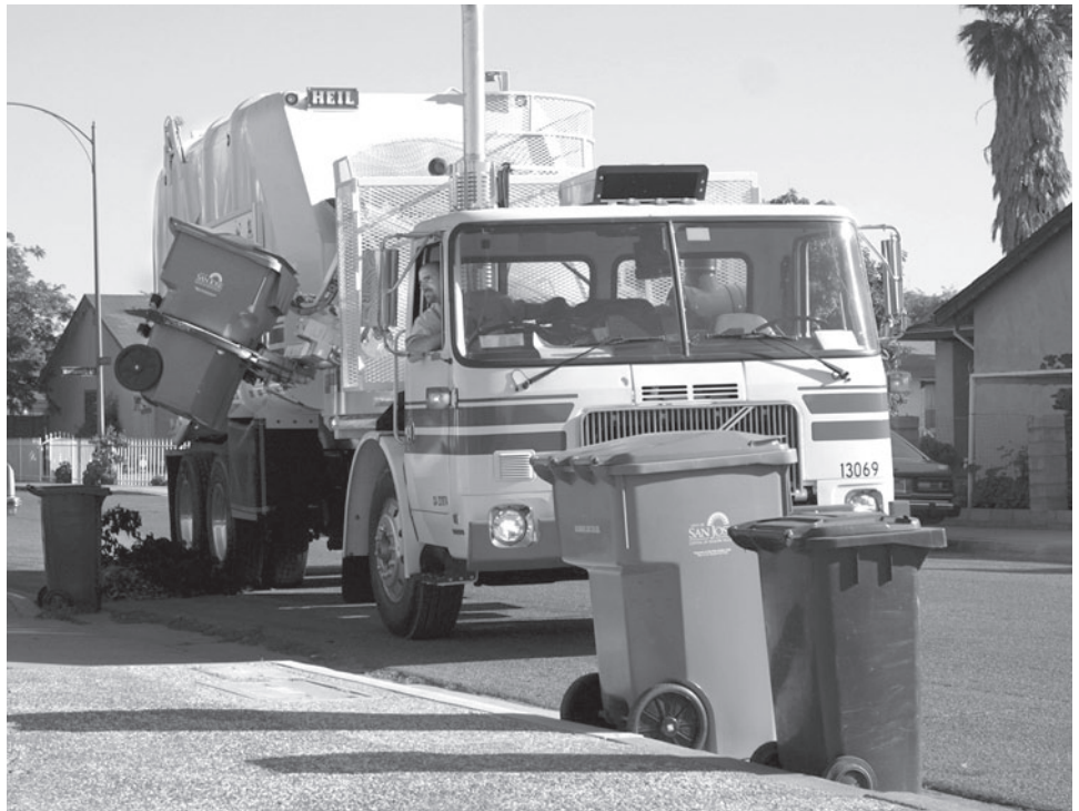
Figure 1: Curbside Recycling in San Jose, California